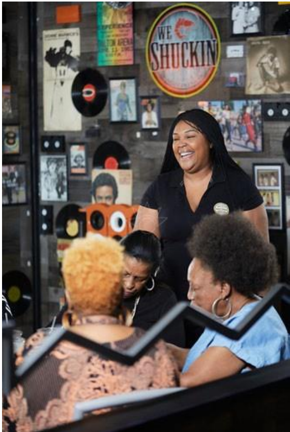
Juanitas' Kitchen, LLC