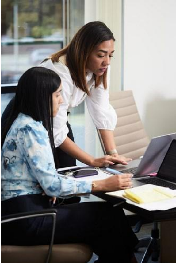
Boutique Ahlang Financial Services, LLC