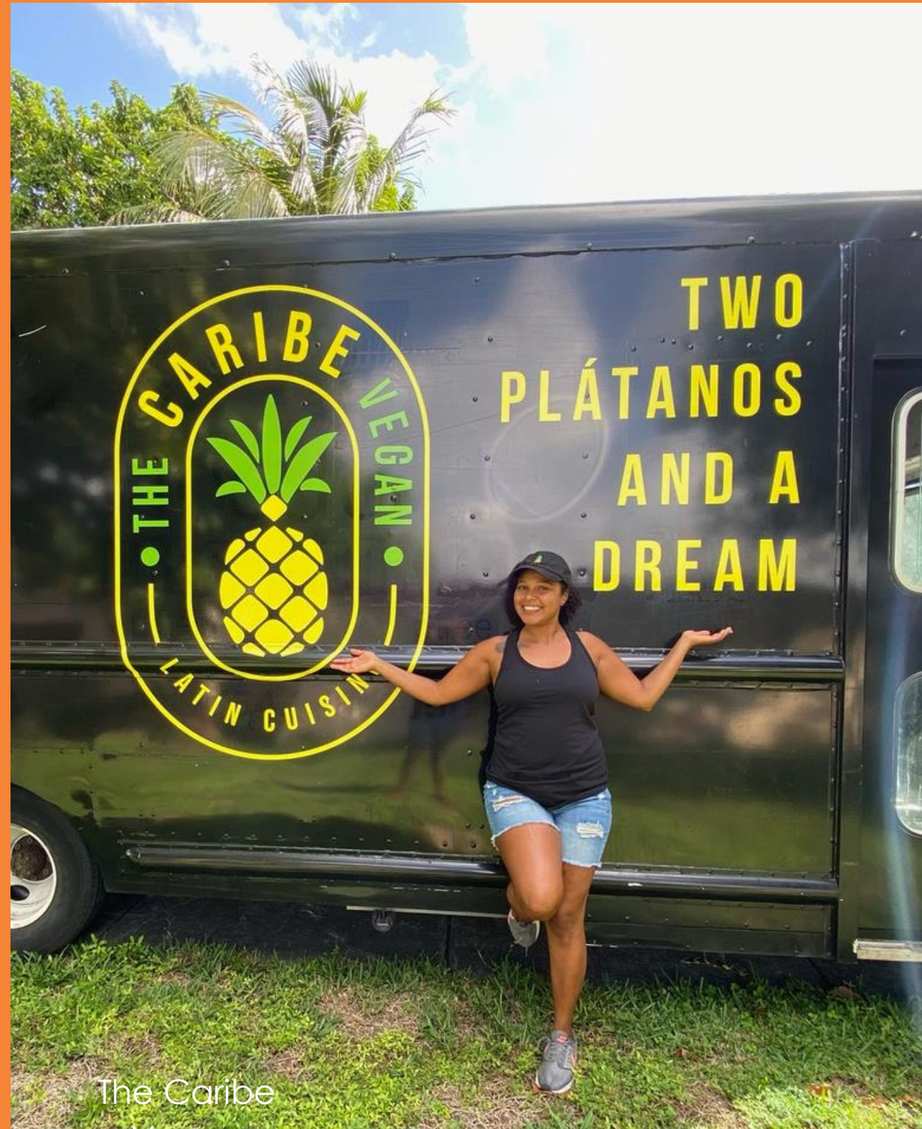
The Caribe Vegan